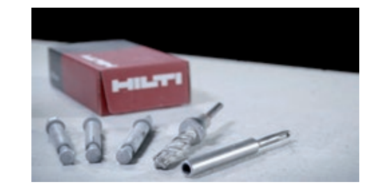
To see a video of the HMU self-undercut installation scan here

Rotary hammer, stop drill bit, setting tool and anchor - a perfectly matched system for error-free undercutting.